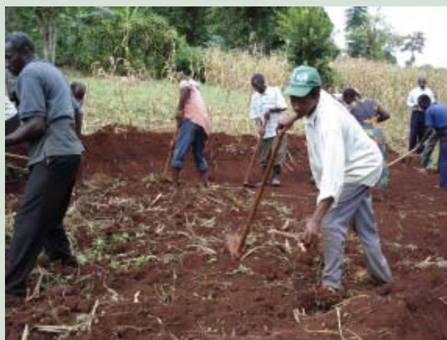
Farmer of Nganjoni Irrigation Project in Moshi rural participating in a practical training in soil and water conservation conducted in February 2007.

Farmers from Kwamlombola, Kwamjwi and Msangai water users groups have started benefiting from a new crop called grain amaranthus. The crop takes 75 days to mature ready to be harvested. It does not require much water as other crops. In 1 acre farmer can harvest up to 1200 kg of amaranthus grains, which fetches 1600 Tsh per kg. "It is a crop that paying well" Emanuel Juael, Kwamlombola farmer.