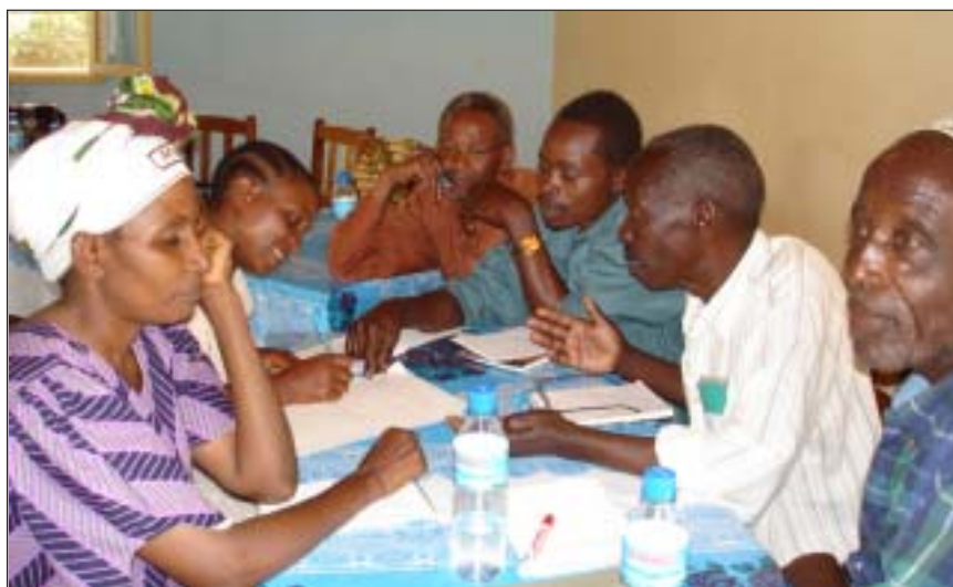
Village Technicians from Mwanga in group work during the training.