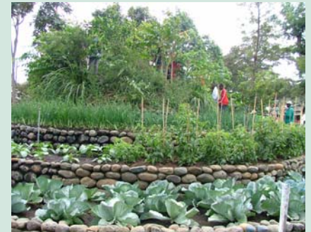
Visitors tour Mt. Hope at TIP's pavilion.

In August 2005, TIP participated in the 13 th Annual Agricultural Show at Themu Grounds in Arusha. "Improved agriculture is the best tool to alleviate poverty", was the theme.