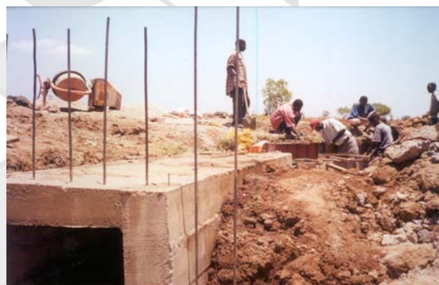
Construction of intake at the Kiladeda river

Expected results of this intervention are increase in water availability, better water management, production increase that will improve food security in the community. Other expected results are environmental protection of areas around the main canal alignment and along Kiladeda River.